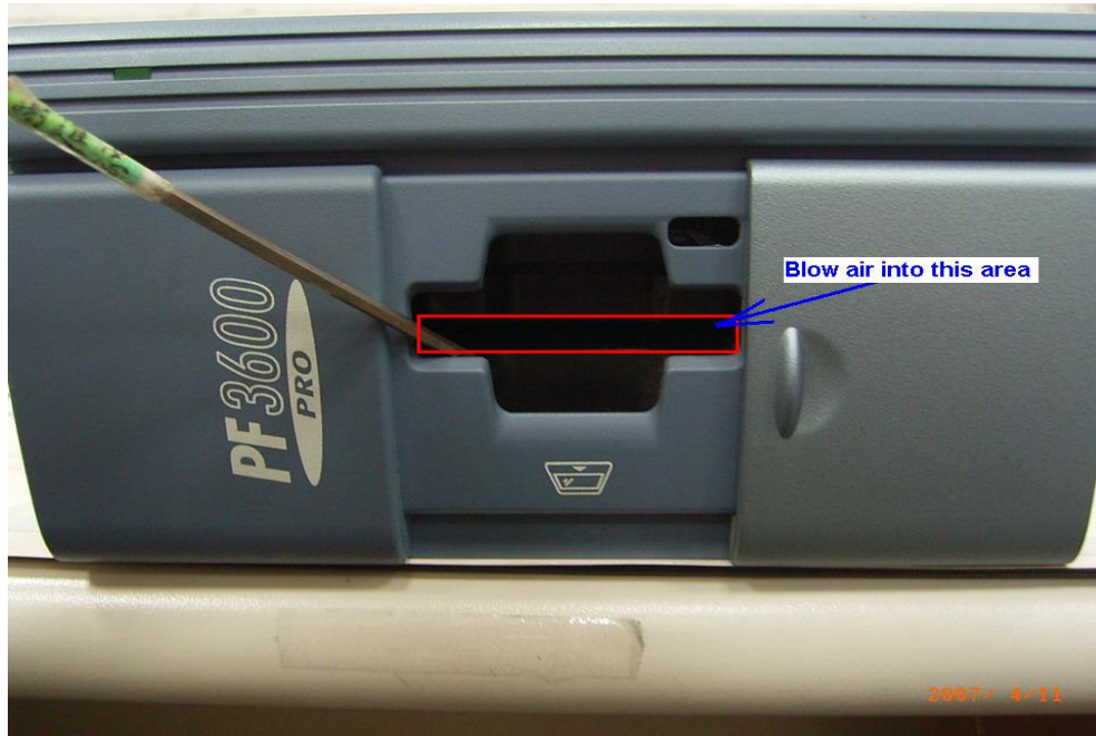
Fig.3 for 1800AFL/3600Pro/Pro3