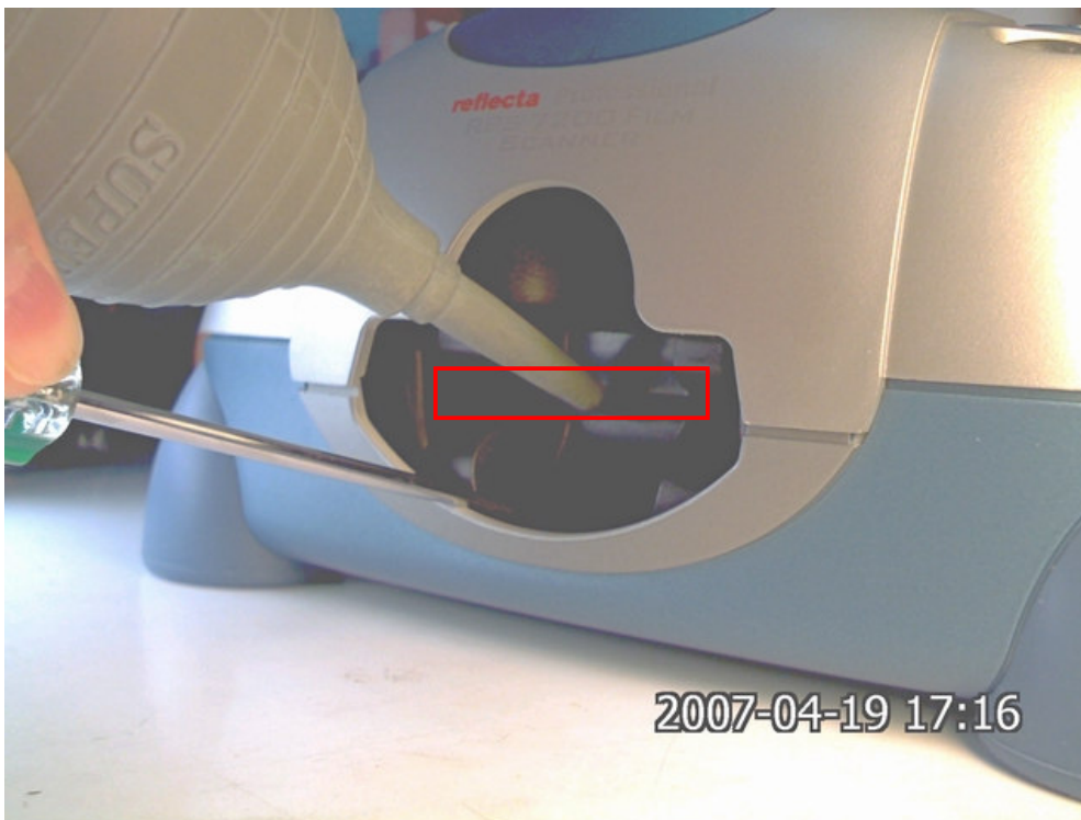
Fig.4 for 3610AFL